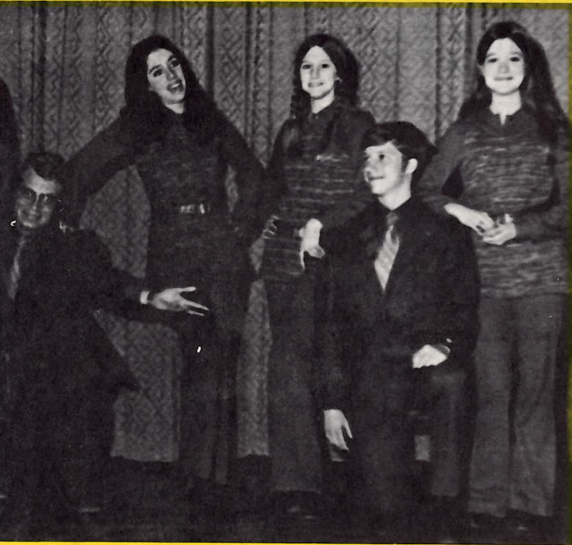
originality in their performance of "South American Getaway" from