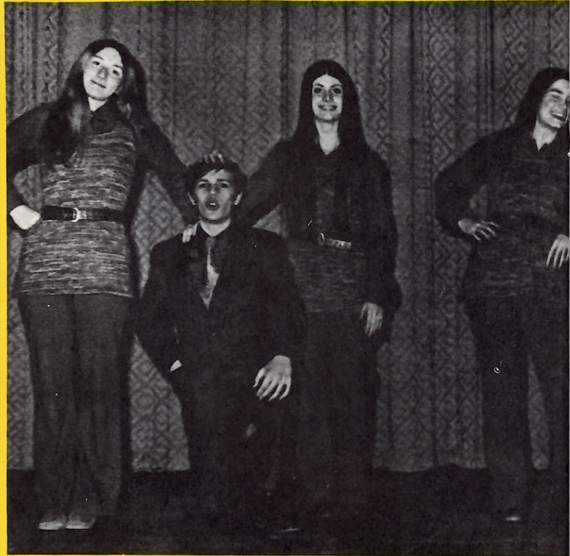
Getting away from it all, the Countesses and Noblemen show off "Butch Cassidy and Sundance Kid."