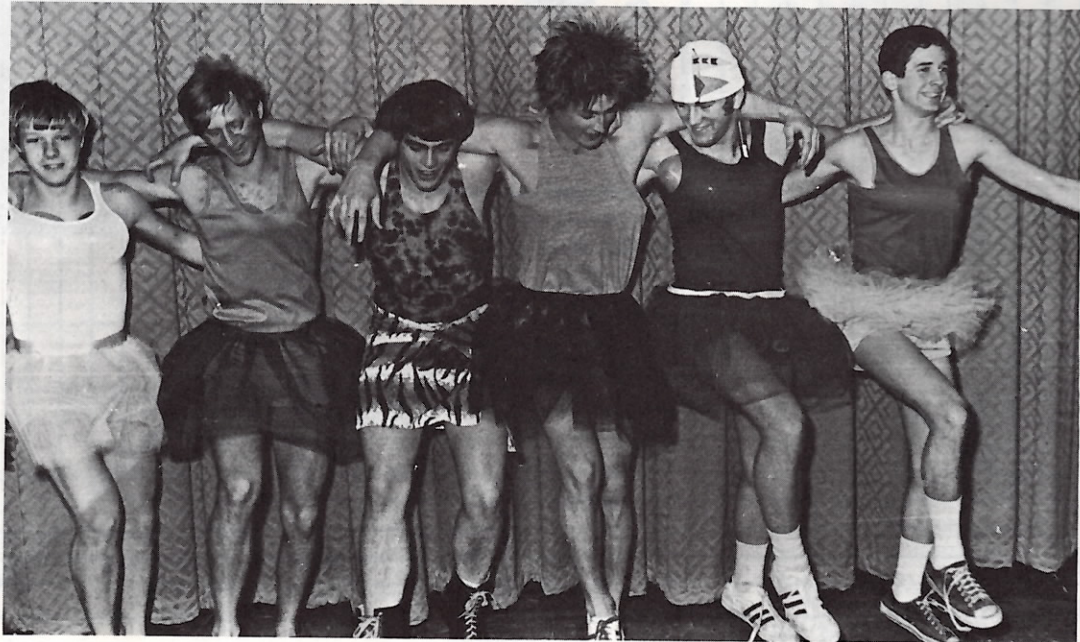
All "Rockette" fans will thrill to S-Club's precision "Can-Can" line.

The Nite of Knights Central Committee, composed of students and teachers, made suggestions and discussed them, Austin added. Alterations were then made and the ideas voted on. Among others, "Casting Toknight" and "Knight on the Town" were also suggested.