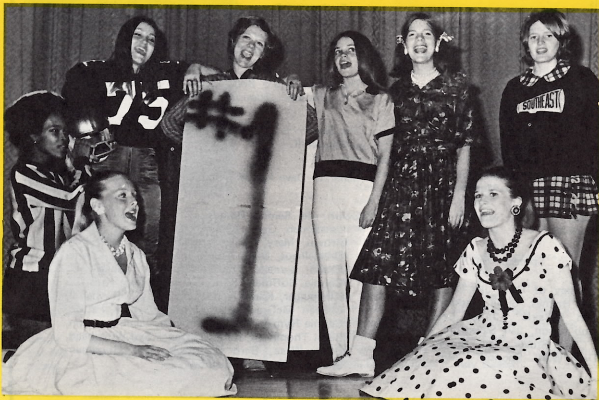
"Bouncing Senior Broads" finish their skits with a small tribute to the "tall, dark, and handsome Southeast boys."