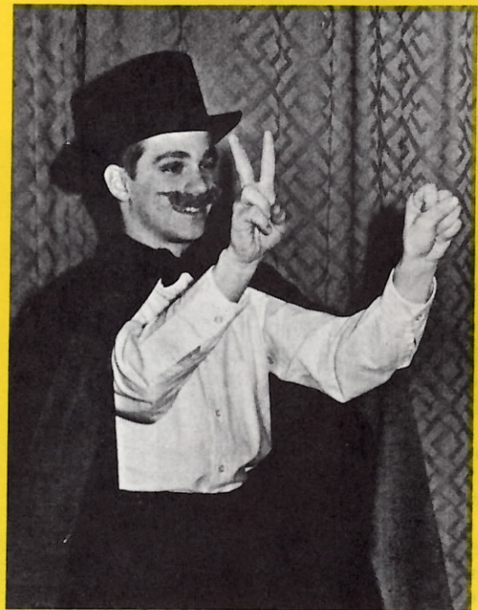
Straight from "The Tonight Show", Albert Brooks (alias Dave Magee) sings out several magic tricks.